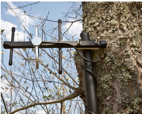
Figure 2. Directional (Yagi) Antenna

For areas where it is difficult to get a good signal, a high gain directional antenna (Yagi) is generally the best choice. The only limitation with directional antennas is that they are not suitable for devices used as repeaters. This is due to the fact that they must be pointed in the direction of the device they will be communicating with. A repeater must communicate with more than one device, therefore a directional antenna is not a good choice for a device that will be used as a repeater.